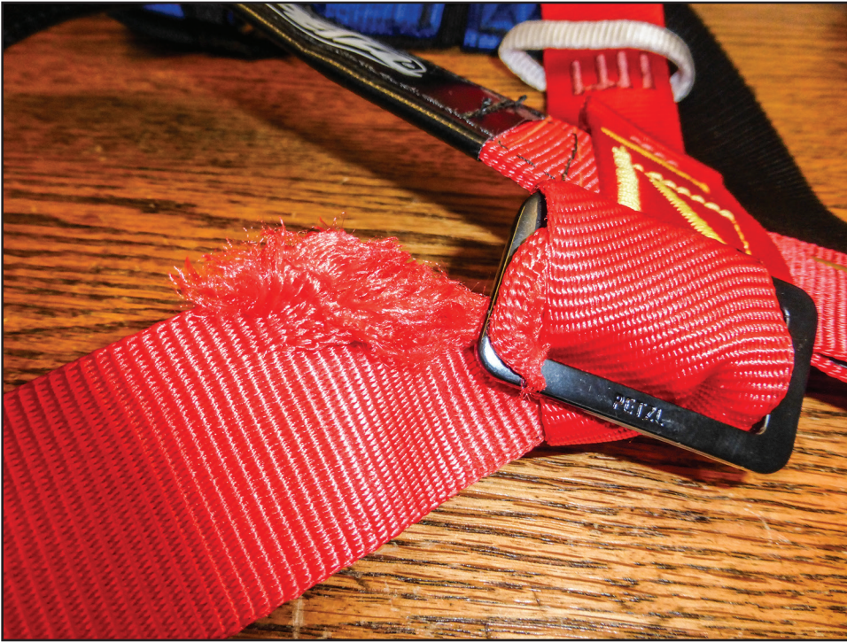
Figure 7—Some webbing failures occurred during the 5,000 pound-force test.