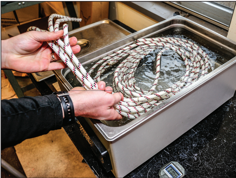
Figure 2—The National Technology and Development Program (NTDP) applied the decontamination protocol to half of the test equipment samples. NTDP soaked the samples in a 55 °C waterbath for 20 minutes or longer.