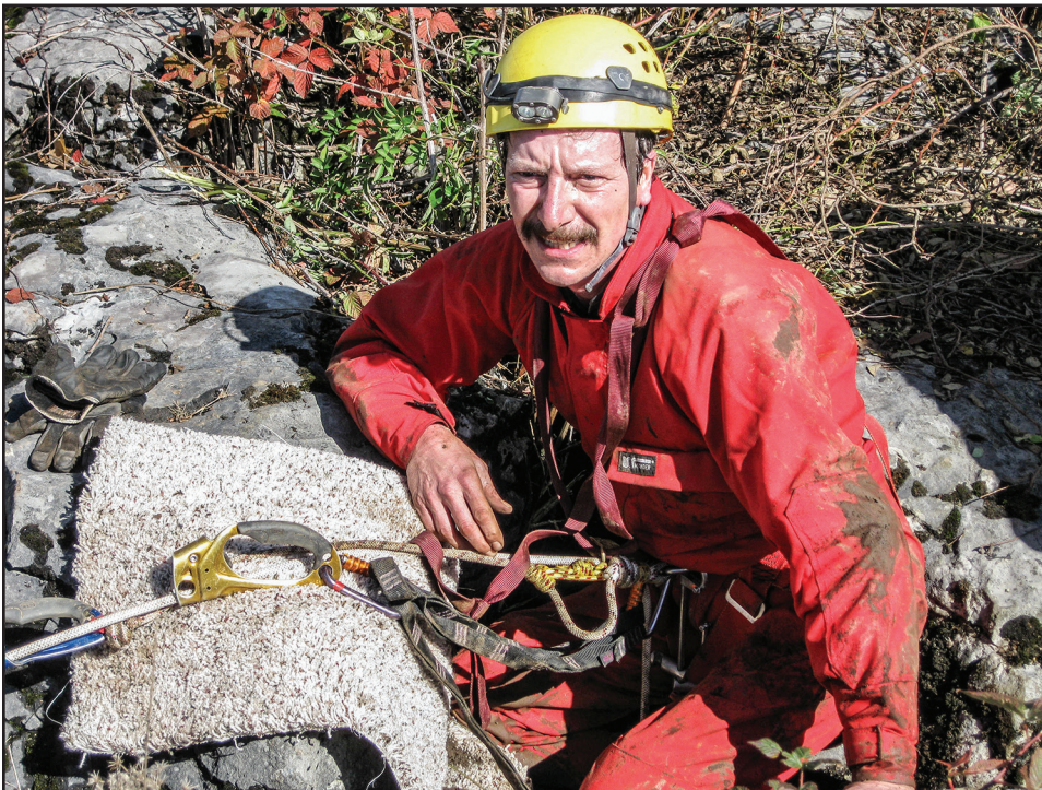
Figure 1—A caver using climbing rope and harness equipment, Grant County, WV.

Agriculture, Forest Service, National Technology and Development Program (NTDP), tested the effects of this method, as prescribed in the current “National White-Nose Syndrome Decontamination Protocol—Version 4.12.2016,” on the strength of selected ropes and harnesses. Test results indicated that treated rope samples had about 0.2 percent to 2.0 percent less strength than untreated ropes. Tests showed that all of the treated ropes had actual breaking strengths well above the minimum breaking strength advertised by the rope manufacturer. All harnesses (treated and untreated) passed the 3,372 pound-force (lbf) test (European Standard EN 12277). There was no evidence that the decontamination procedure affected the performance of the harnesses.