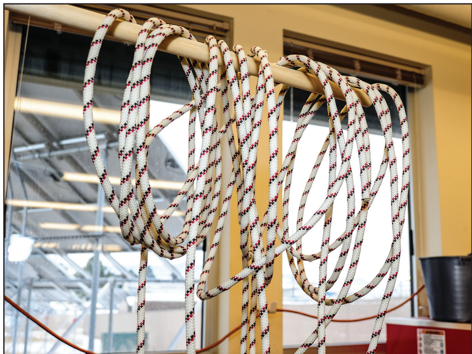
Figure 3—The National Technology and Development Program allowed the treated samples to air dry overnight.