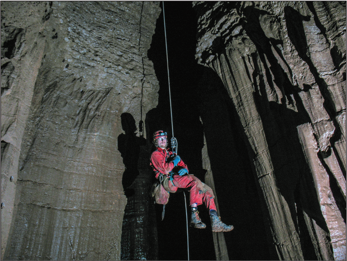
A caver completing a 120-foot drop, Bland County, VA.