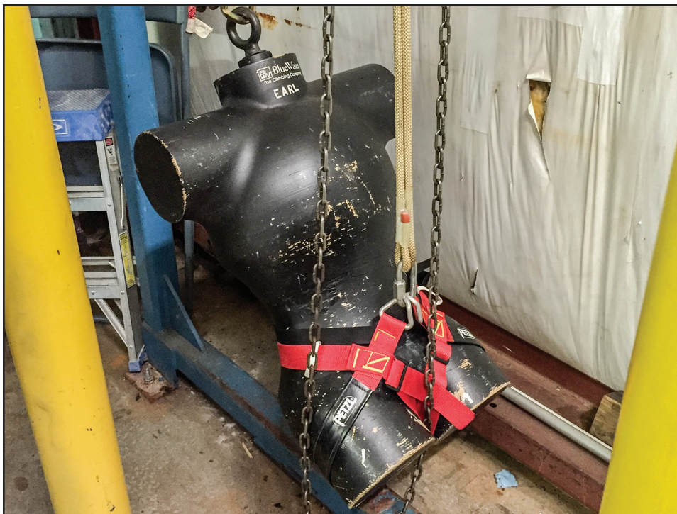
Figure 6—A dummy and test apparatus setup ready for a harness pull test.

As a secondary test, we asked BlueWater Ropes to test the harnesses to failure. BlueWater Ropes could not test to failure. They retested harnesses using the same criteria as earlier tests, but they applied increasing weight loads to a maximum of about 5,000 lbf, the limits of their testing machine.