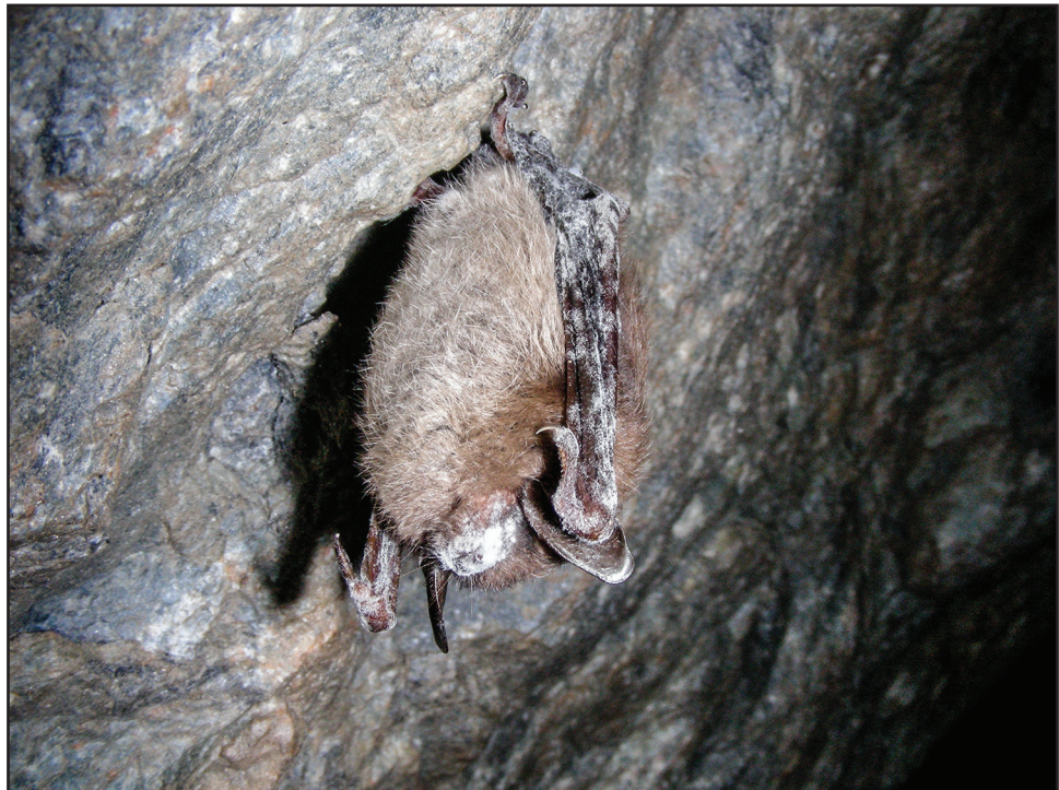
A little brown bat with white-nose syndrome, Windsor County, VT.

Decontaminating caving gear is important for reducing the spread of pathogens such as the fungus that causes white-nose syndrome in bats. The U.S. Department of Agriculture, Forest Service, National Technology and Development Program (NTDP), evaluated the effect of the current decontamination protocol on the strength of popular models of ropes and harnesses. The decontamination procedure had minimal effects on the strength of ropes or harnesses that NTDP tested.