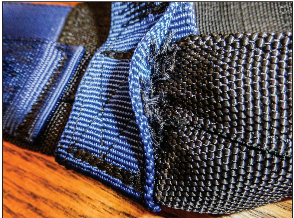
Figure 8—Some seam failures occurred during the 5,000 pound-force test.