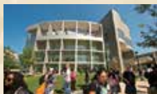
Cleveland State University

These universities grant academic credit to students who are enrolled at them.