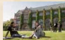
University of Idaho