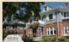
Idaho State University