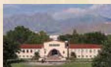
New Mexico State University