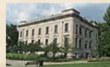
Indiana State University