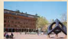
Western Washington University