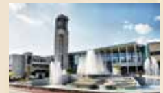
Missouri State University