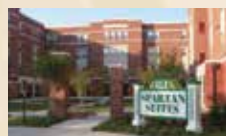
Norfolk State University