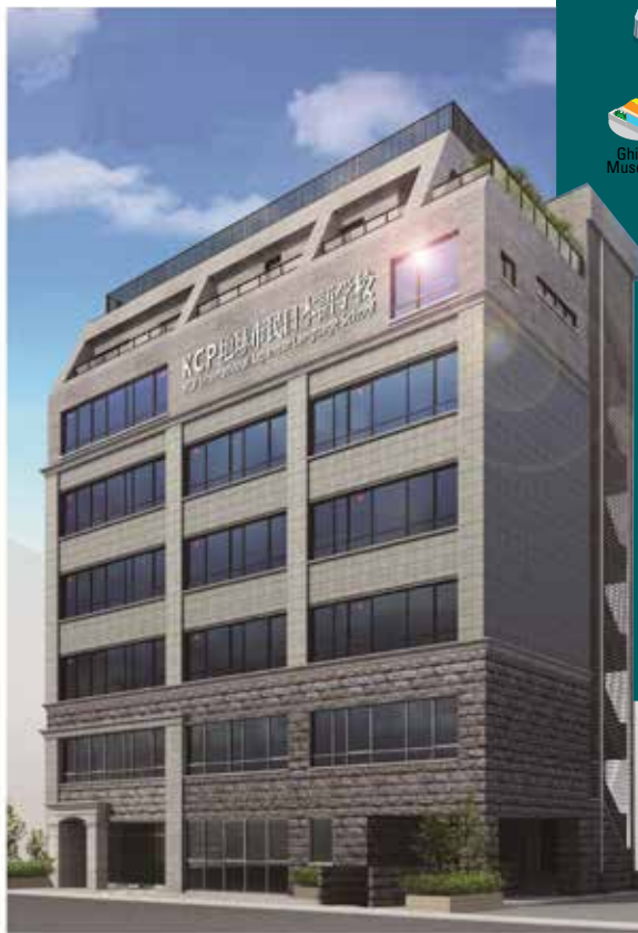
KCP Campus in Tokyo

Offices are open 9 am–6 pm Monday through Friday. Morning classes run 9 am–12:15 pm; afternoon classes run 1:30 pm–4:45 pm. Campus amenities include a main office, classrooms, a study room, student lounges, a computer room (word processing in English and Japanese, a printer, and internet access), and a sick room.