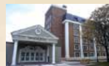
The College of New Jersey