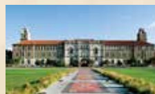
Texas Tech University