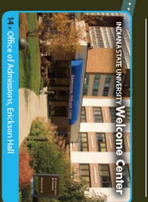
14 - Office of Admissions, Erickson Hall